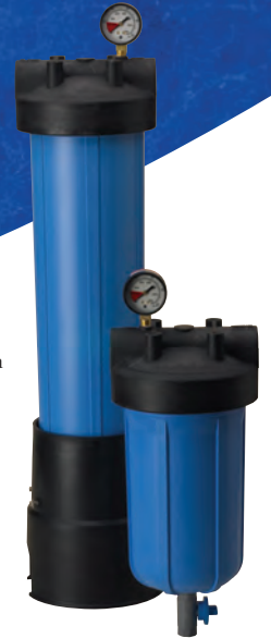
PBH-410 (Shown with bag vessel stand)*