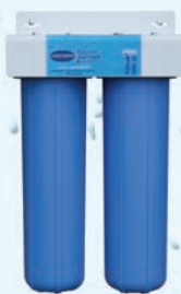
ICS-STP (SP and TP Combined) 27x16x9"

Find Your Perfect PolyHalt® Conditioner Select Parameter(s) Below and Model on Right